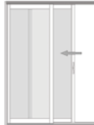
SINGLE SLIDER (OX) shown (also available in XO)